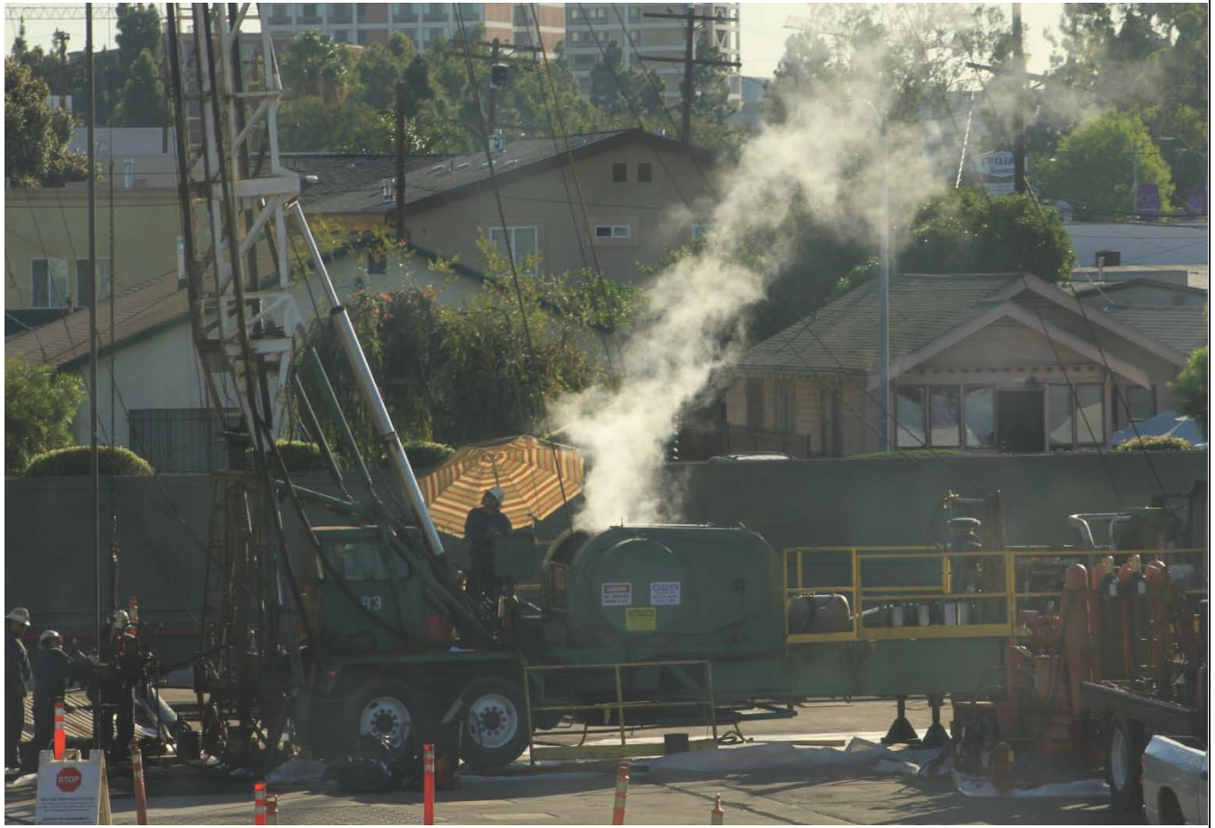
Figure 1: Oil drilling in a residential area of South Central Los Angeles, with homes immediately adjacent to oil-extraction operations using a highly polluting diesel rig.

1 2 3 4 5 6 7 8 9 10 11 12 13 14 15 16 17 18 19 20 21 22 23 24 25 26 27 28